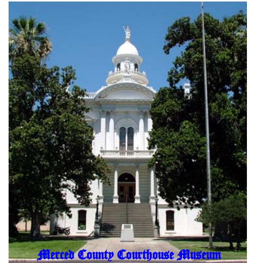
Merced County Courthouse Museum