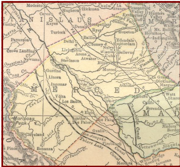
Merced County, 1914